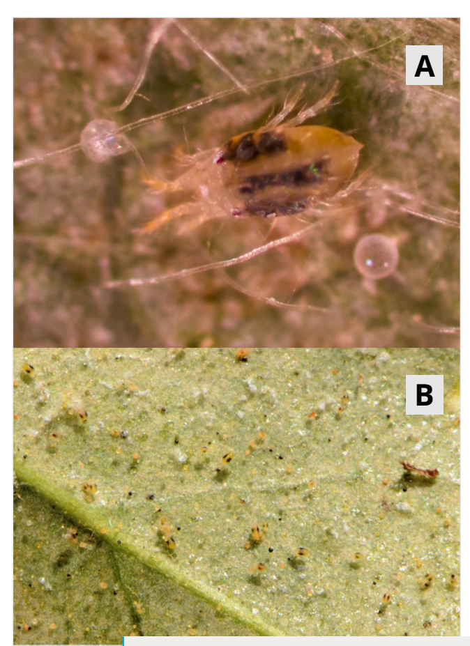
Figure 1. A. Adult twospotted spider mite and egg. B. Twospotted spider mites (small, twodotted creatures) on the underside of a leaf.

The twospotted spider mite ( Tetranychus urticae Koch) is oval to elliptical in shape. Females are 1/50 inch (0.4 mm) long, while males are smaller. The body color of the twospotted spider mite ranges from brown, orange red, greenish yellow, to translucent. The color of overwintering females can be orange to orange red. As its name suggests, this mite species has two large dark spots on its back. Newly molted mites may lack these dark spots, as they are the accumulation of body waste (Fig. 1).