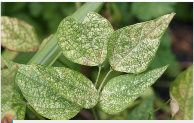
Leaf stippling symptoms caused by spider mite feeding.

Twospotted spider mites have a wide host range, including vegetables, fruits, and ornamental crops, and are a serious pest of greenhouses, nurseries, and field-grown crops. All active life stages of twospotted spider mites (larva, nymph, and adult) can feed on plant tissue. With their piercing-sucking mouthparts, twospotted spider mites feed on the cell contents of the leaf. They also inject saliva during feeding, which can cause discoloration, necrosis, or abnormalities on leaves, stems, and flowers. They feed mainly on the underside of the leaf. The initial feeding injury appears