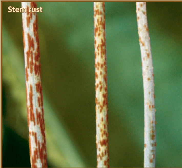
Figure 3. Examples of the variability in symptoms caused by stem rust (below), leaf rust (upper right) and stripe rust (lower right) as a result of unique interactions with wheat or barley varieties.

All three diseases have unique interactions with common varieties of wheat and barley. These interactions can modify the disease symptoms resulting in reduced lesion size and varying amounts of yellow or tan tissue surrounding the lesions (Figure 3). Becoming familiar with the range of possible symptoms for these diseases will improve the accuracy of the diagnosis and the management of these economically important diseases.