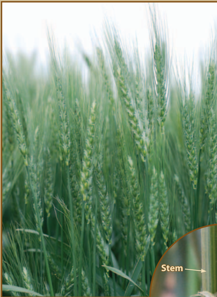
Figure 1. The diagnosis of rust diseases requires some basic understanding of plant anatomy and a quick review of this information may improve the accuracy of the identification process.

depends on host susceptibility and weather conditions, but the loss also is influenced by the timing and severity of disease outbreaks relative to crop growth stage. The greatest yield losses occur when one or more of these diseases occur before the heading stage of development. Early detection and proper identification are critical to in-season disease management and future variety selection.